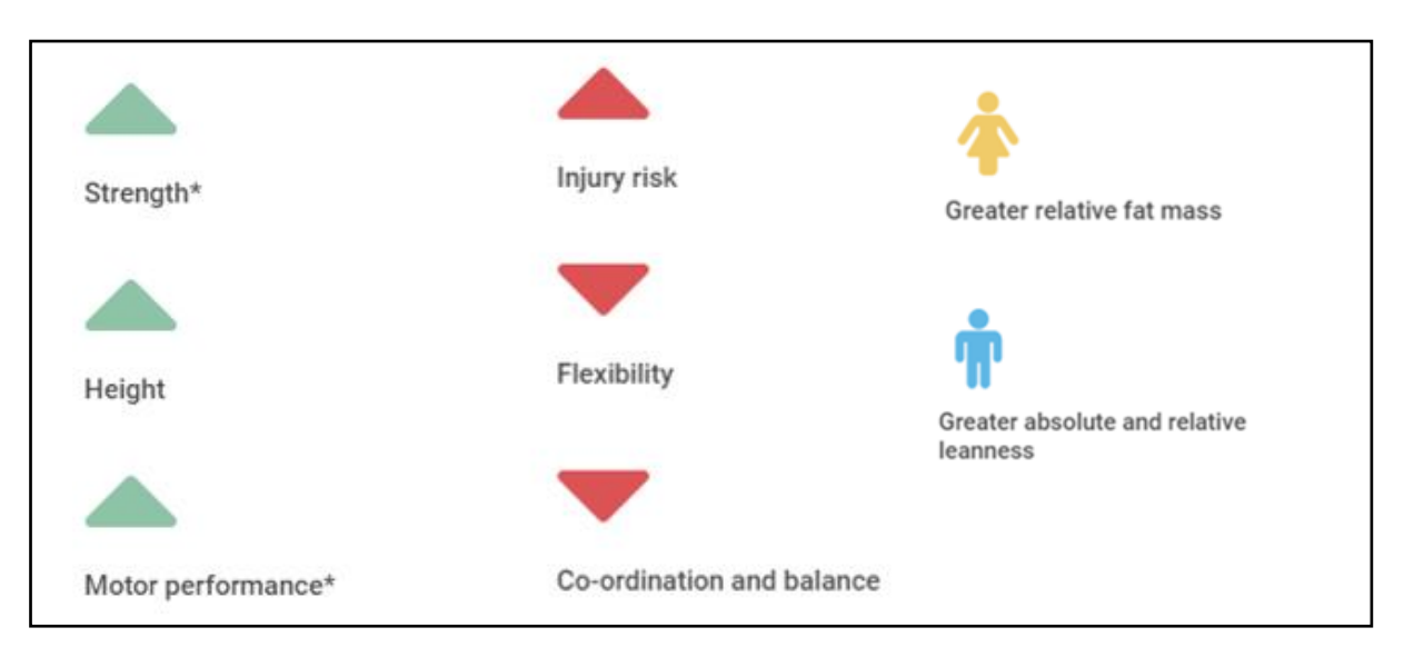
Figure 4. Implications of growth upon physical performance and capacity

Most changes to physical performance are attributed to the timing of growth spurts and/or anatomical and functional changes in the joints which occur during adolescence (Malina, Bouchard, & Bar-Or, 2004). Basic physical changes such as increases in height, body fat and muscle mass have a temporary but significant effect upon physical performance in a number of ways: