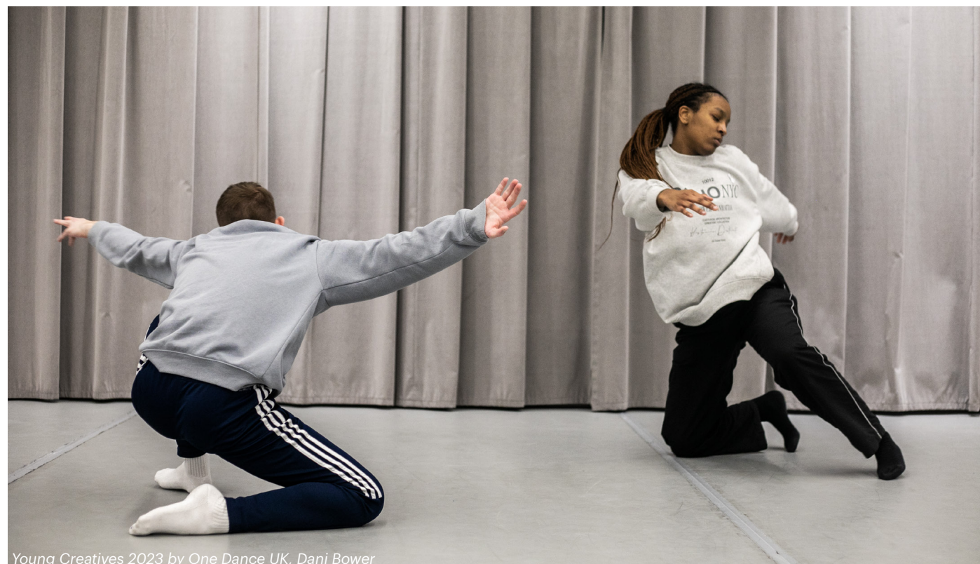
Young Creatives 2023 by One Dance UK

If you have any questions about completing the application form or need help to submit your application please call One Dance UK on 020 7713 0730 or email youngcreatives@onedanceuk.org . We are able to support people with additional needs to submit their application.