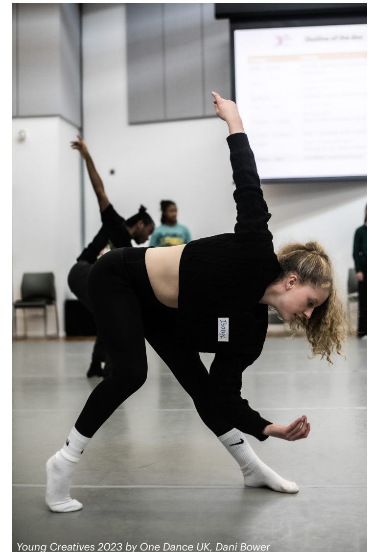
Young Creatives 2023 by One Dance UK, Dani Bower

Please read the guidance notes in full and make sure you can commit to the full programme from January to completion in July before applying. Young Creatives is a special opportunity and is always oversubscribed so full commitment is essential.