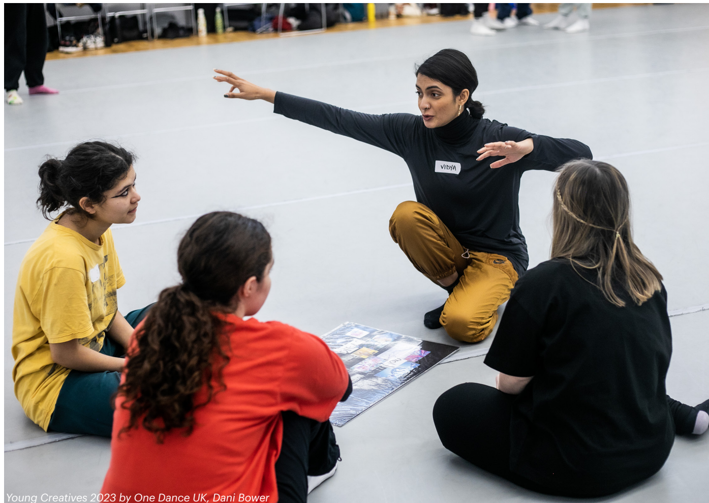
Young Creatives 2023 by One Dance UK