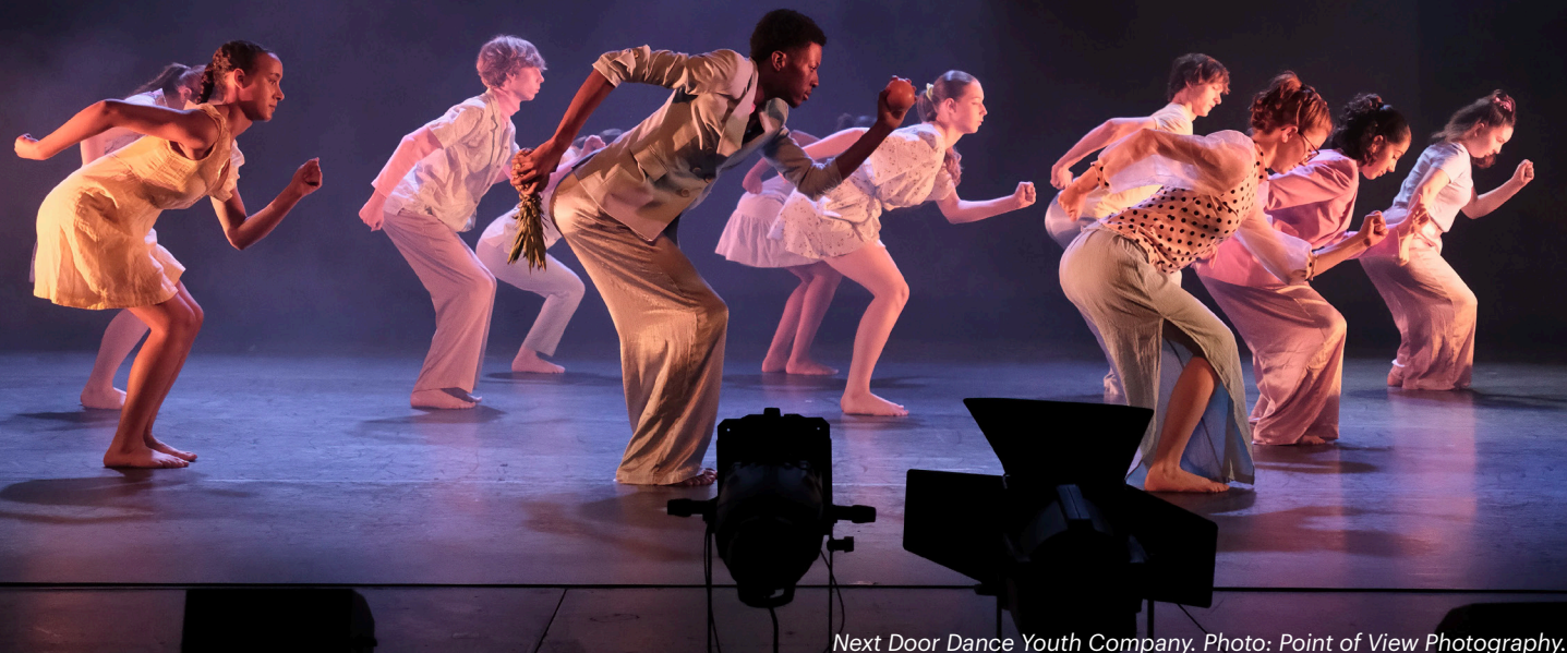
Next Door Dance Youth Company.

U.Dance National Festival Participant 2024