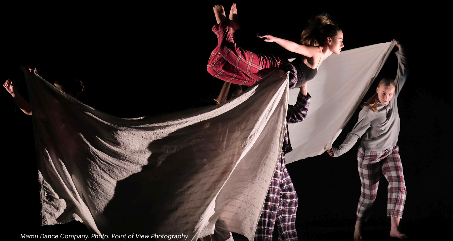
Mamu Dance Company.