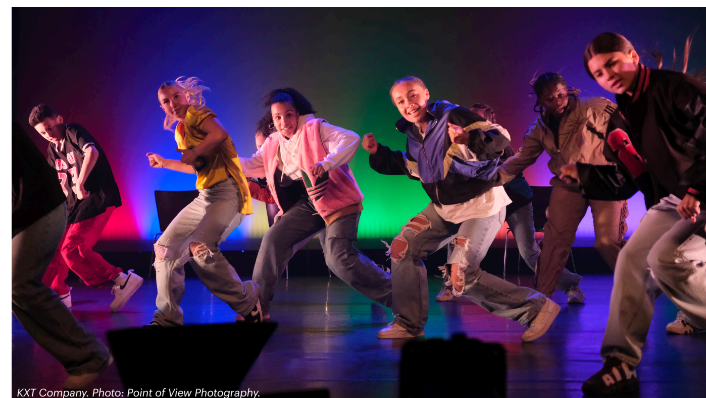
KXT Company.

If you would like your piece to be considered for the U.Dance National Festival ensure you tick the relevant box on the application form. This option is available for both U.Dance on Stage and U.Dance on Screen submissions.