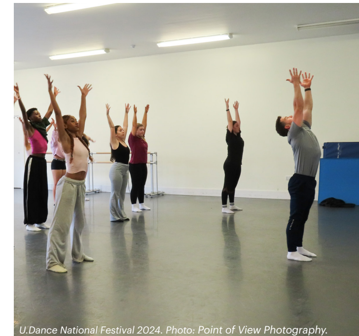
U.Dance National Festival 2024.