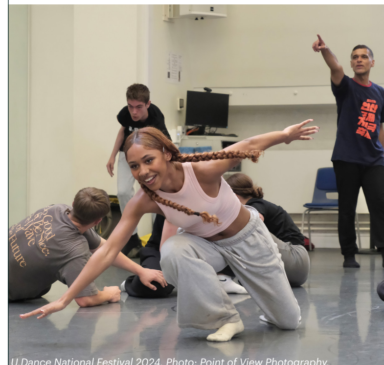
U.Dance National Festival 2024.