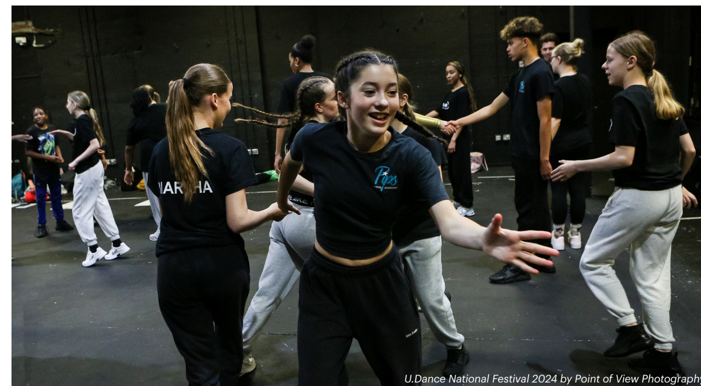
U.Dance National Festival 2024 by Point of View Photography.

If music rights are not secured, for the online showcase the U.Dance Regional Platform organiser will overlay the track with similar royalty-free music.