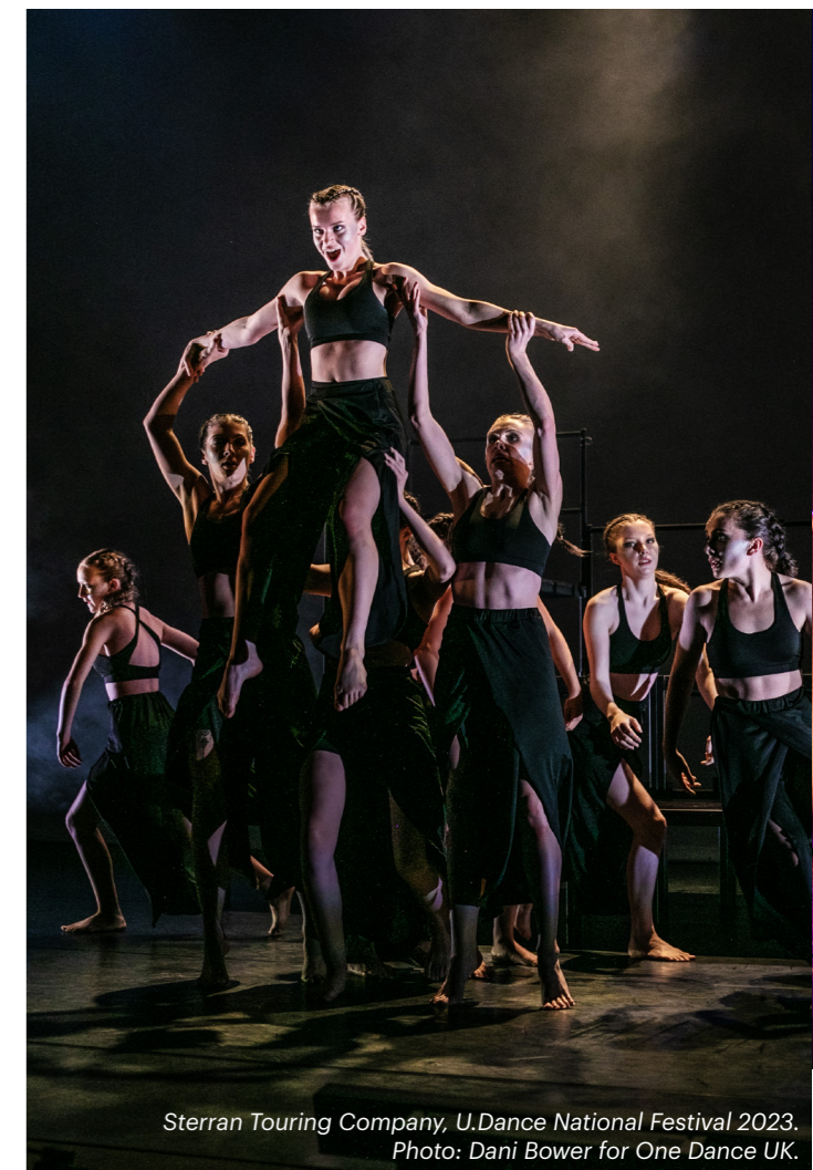
Sterran Touring Company, U.Dance National Festival 2023.

The structure and exact timeline of each U.Dance Regional Platform is unique, and each will have its own application and selection process. Please contact your U.Dance Regional Platform representative for details using the contact information below.