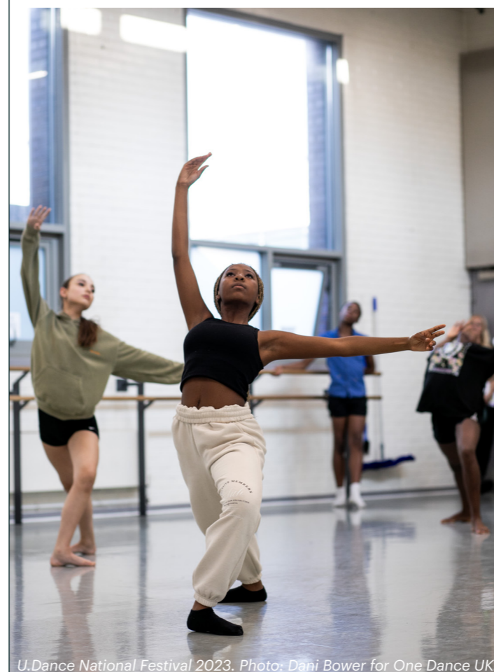
U.Dance National Festival 2023.

A selection panel will select a small number of groups from each U.Dance Regional Platform to have their work showcased at the U.Dance National Festival 2024. Further information relating to the National Panel and criteria are detailed later in this Application Pack.