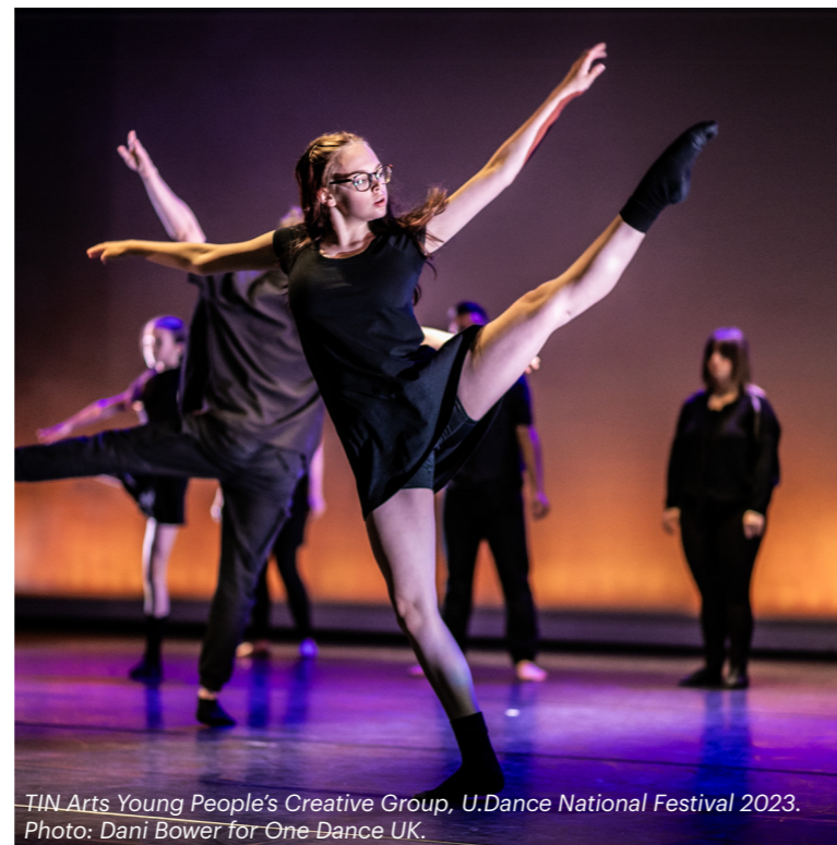
TIN Arts Young People's Creative Group, U.Dance National Festival 2023.

More details will be shared in the coming months from One Dance UK and event partners.