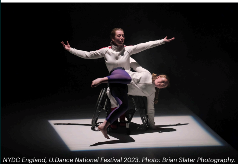
NYDC England, U.Dance National Festival 2023.