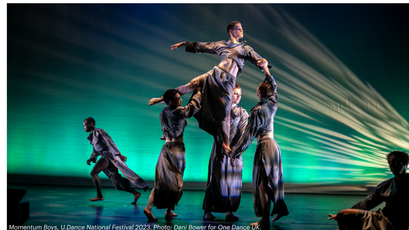
Momentum Boys, U.Dance National Festival 2023.

If you would like your piece to be considered for the U.Dance National Festival ensure you tick the relevant box on the application form. This option is available for both U.Dance on Stage and U.Dance on Screen submissions.