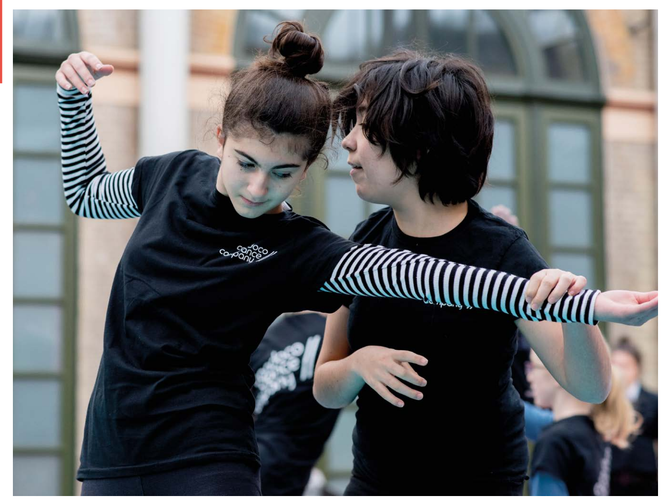
Photo © Camilla Greenwell / Candoco Dance Company - Cando2 performance