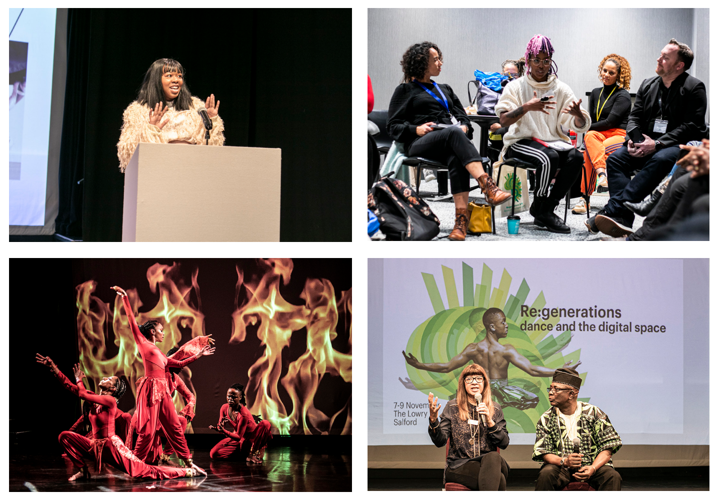
Re:generations Conference 2019 by One Dance UK

The conference invited scholars, artists and dance practitioners from the Caribbean, Africa, the United States, Canada and the UK to share their research with other artists, practitioners, dance teachers, students and the general public.